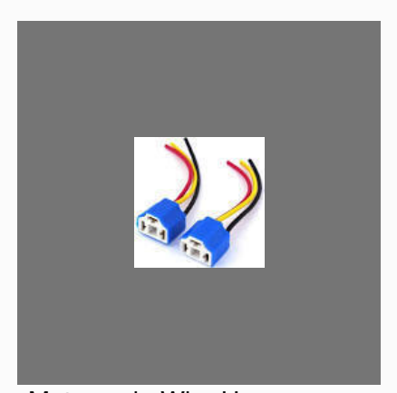
Motorcycle Wire Harness