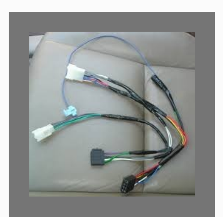
Automobile Wiring Harness