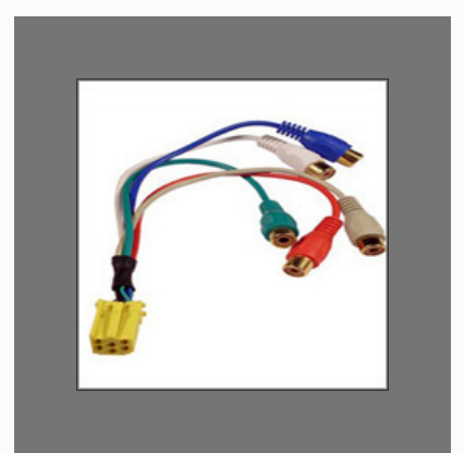
Car Audio Wire Harness