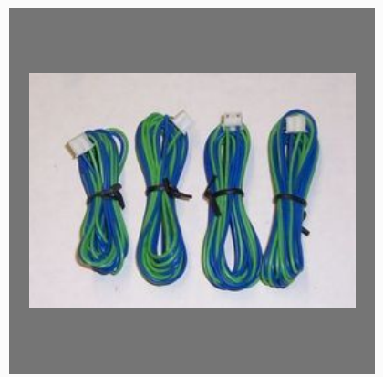
Automobiles Wiring Harness for Door Lock Unlock