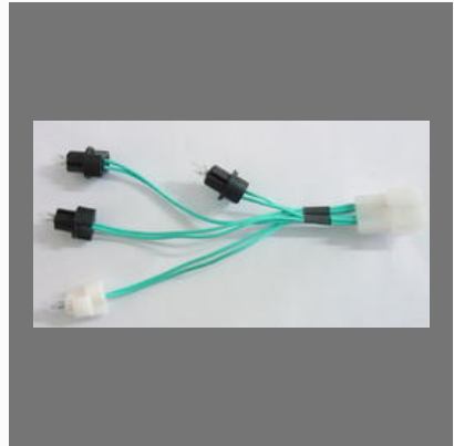
Electric Wiring Harness for Lamp Holder Assembly