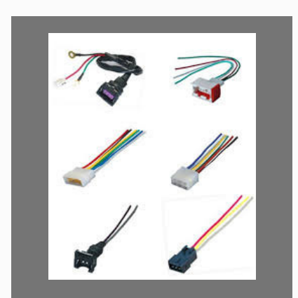
Universal Motorcycle Wiring Harness