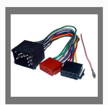
Electric Cable Harness