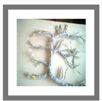
Electric Panel Wiring Harness