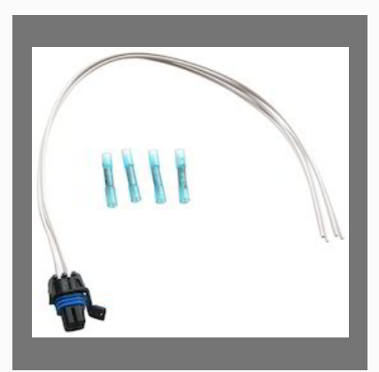
Automobile Wiring Harness Sensors