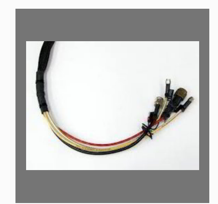
Electronic Wiring Harness